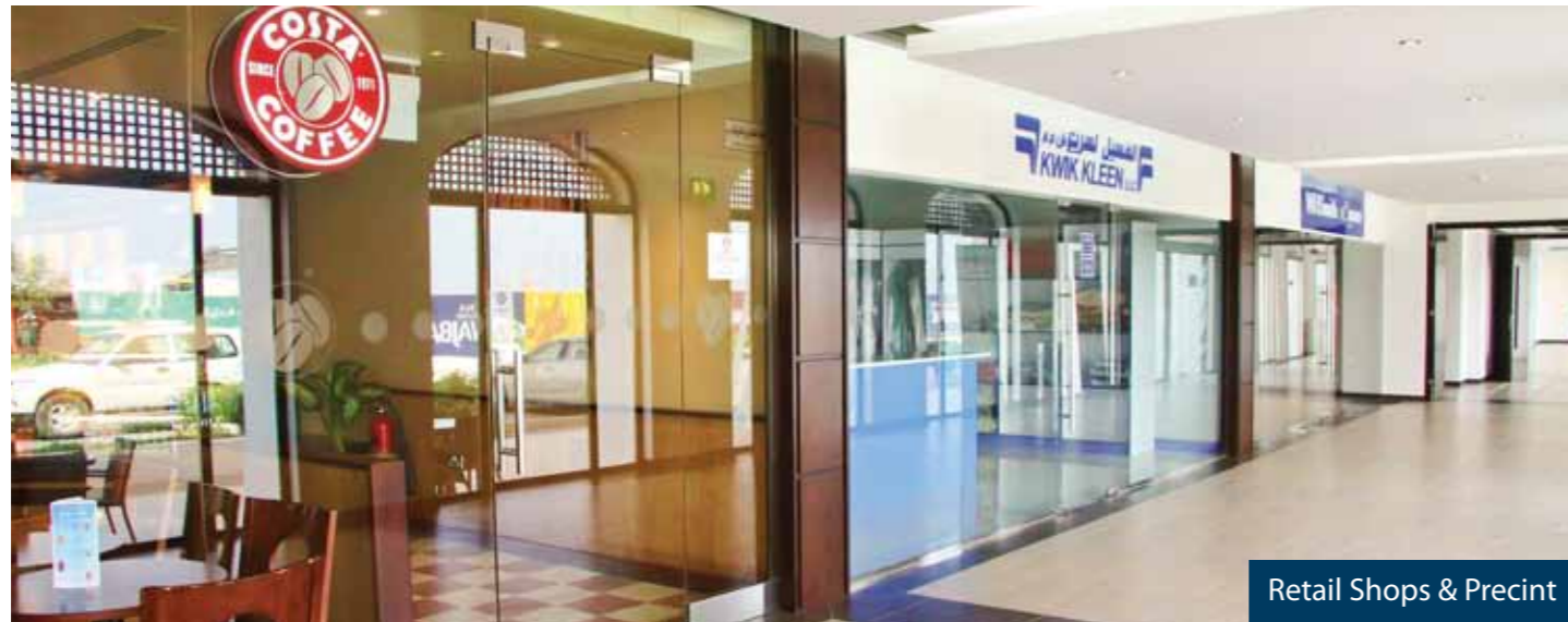
Retail Shops & Precint